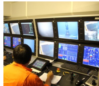
ROV Pilot Training at the SBSS ROV School