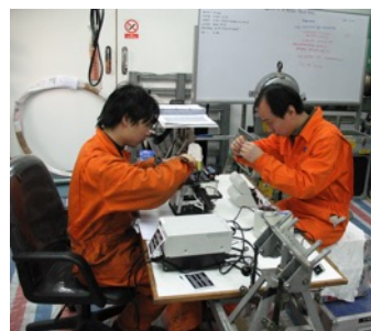
Daily work at the SBSS Jointing School